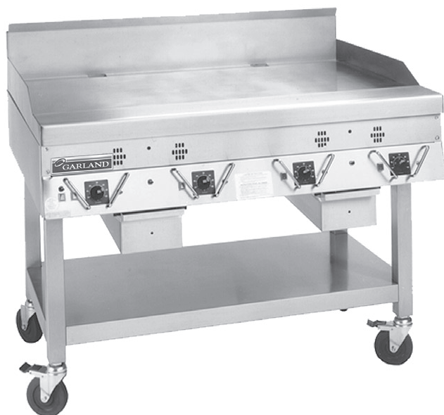
Model ECG-48R (Shown on optional stand)